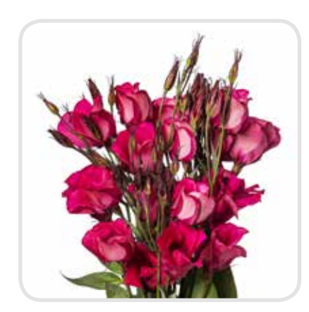
Adom Deep Red III intense rosy red on broad, wavy petals

A high standard Lisianthus strain with large single flowers in unique colours. Stem length easily reaches 75 cm. The culture takes slightly longer (10-14 days) than other varieties.