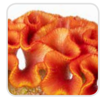
Act Zara Orange