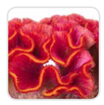
Act Enda Salmon