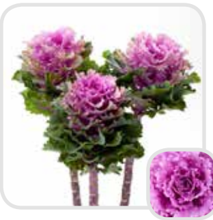
Empire Ksenia Pink, crenulated leaves, crop forming, very uniform. Mid to late type, earlier colouring than Katya.