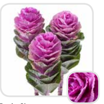
Empire Olga Purple rose, flat, round leaves, stretched head on tall stems. Mid season variety for large scale, trouble free production.