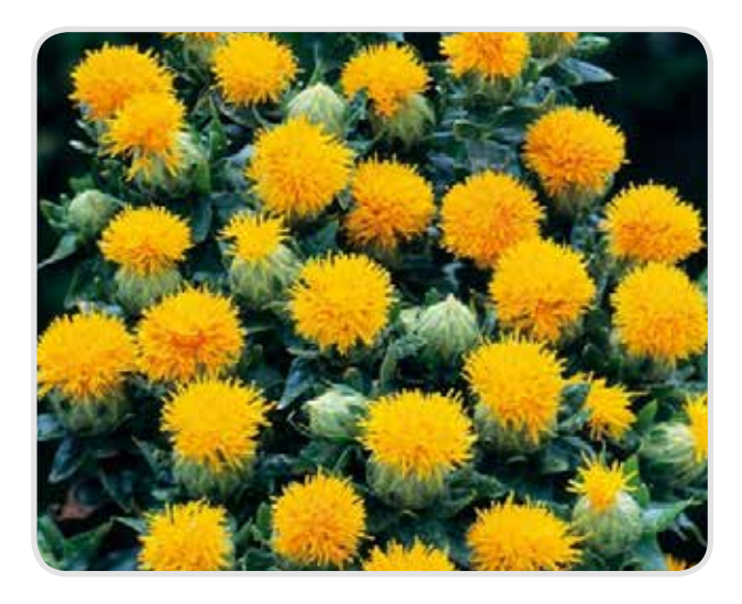
Kinko Clear orange, rounded top foliage, freely branching.