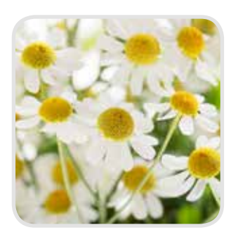
Campagne Imp. Single-flowered spray type Matricaria with small pure white ray florets around yellow disc. Improved selection with dark green foliage and natural appeal.

Scentless selection with multiple small, pure white snowball type flowers of almost 2 cm across, held above lacy foliage. Uniform in growth, flowering time and quality.