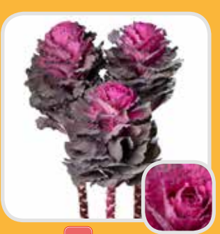
Elegance New Cherry red compact head, surrounded by round, dark green outer leaves. Very uniform selection with medium colouring speed and superb colour holding ability. For mid to late harvest.