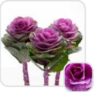
Empire Vera Light rose, flat, round leaves, waterlily-type head, marbled foliage. Early type, colouring a few days earlier than Olga.