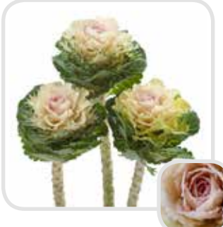
Empire Arina White heart surrounded by green, crenulated leaves. For mid season to late harvest.