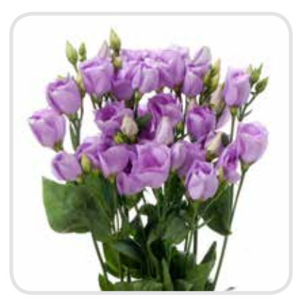
Carice Lavender III rich lavender, medium-sized, single Very popular variety.