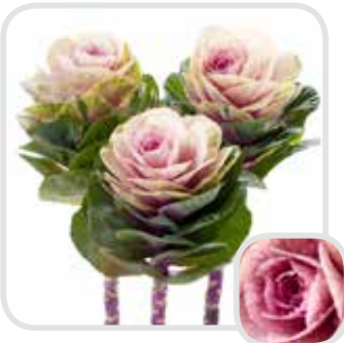
Empire Luba Salmon rose heart surrounded by flat, round marbled foliage. For early harvest.