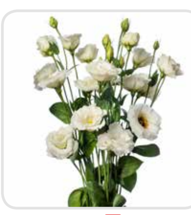
Evanthi White Wink III