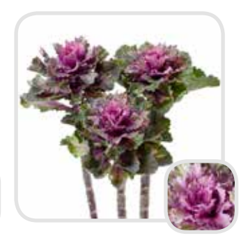
Empire Katinka Deep pink/green, crenulated leaves, bushy type. For mid early to late crops.