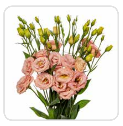
Peach Revelation III large double salmon peach flowers.