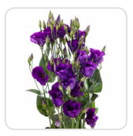
Colorado Purple Imp. II medium-sized single purple flowers.