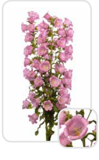
Big Ben Pink Larger sized light pink flower bells.