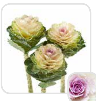
Empire Akilina White heart surrounded by blue green, crenulated leaves. Smaller type with good field standability. For early and mid season harvest.