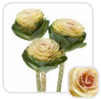
Empire Alexandra White, waterlily type head surrounded by green, round leaves. Excellent glasshouse crop.