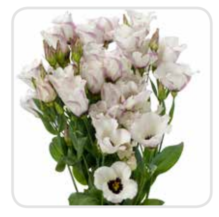
Milac Shadow I – II small-flowered, single, tulip-shaped white with lilac blush and edge.