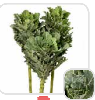
Empire Dunya Rose heart surrounded by gray-green, strongly crenulated and curled foliage. Very late colouring type for late harvest.