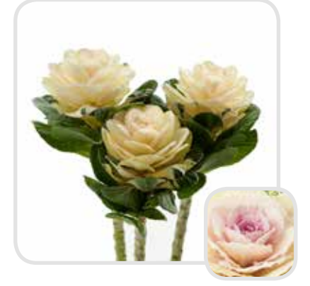
Empire Anna White heart with flat, round leaves. All-round variety, 7 days earlier than standard types, and holding well at the end of the season.

Empire Antonina White, waterlily-type head and round leaves. Best in early sowings. 10 days earlier than standard varieties.