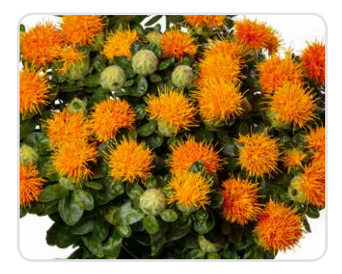
Zanzibar Deep orange, large flower buds and almost thornless leaves, slightly later flowering than Kinko.