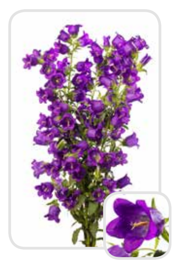
Big Ben Deep Blue Deep blue, very uniform, fast growing strain.

The Big Ben series can cope with many different climatic conditions, although extreme cold and hot weather must be avoided. In the young plant stage 8-hour short day conditions are required in order to secure sufficient stem length. When planted (6 to 8 weeks after sowing), the plants need 16-hour long days or supplemental lighting. Big Ben is suitable for both field and (unheated) greenhouse production and is harvested over a longer period.