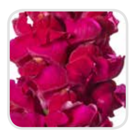
Animation Royal Purple