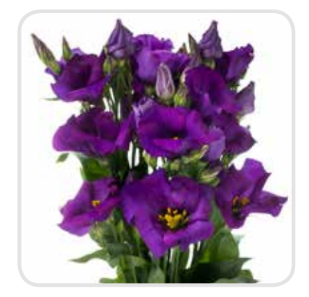
Asenka III deep purple blue, single flowers.