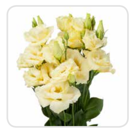
Ophira III large, fully double moon yellow flowers with wavy petals. Flower buds branch out in the top.