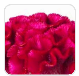
Act Dara Velvet