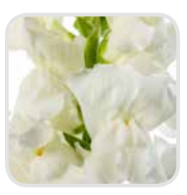
Animation White Imp. NEW