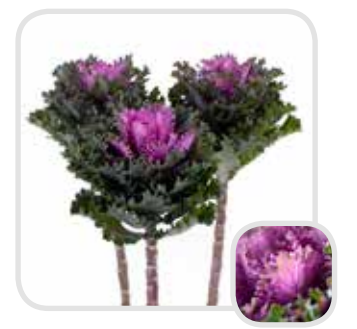
Empire Kysia Rose heart, crenulated leaves, slightly shorter stems. Mid season culture.