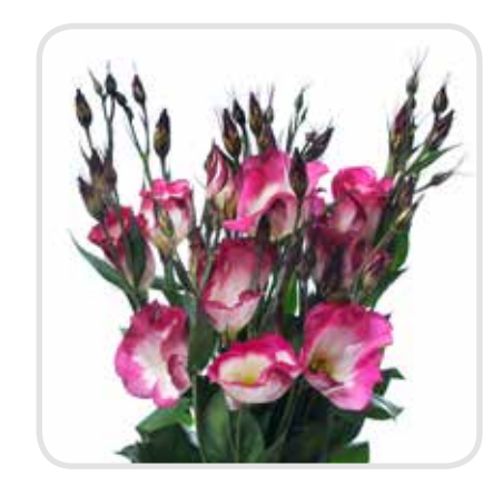
Adom Red Picotee III white with distinct rosy red edge