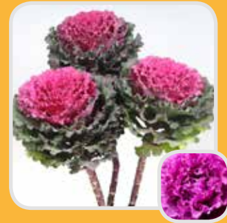
First Lady Bright red heart of dense, fringed leaves surrounded by deep green crenulated foliage. For mid to late harvest.