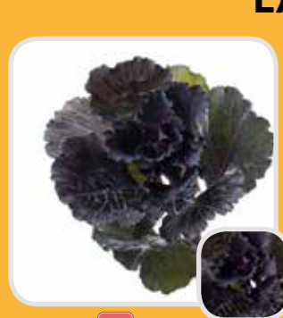
Black Leaf NEW Deep purple with green fringed voluminous foliage. Attractive type for mid to late harvest.