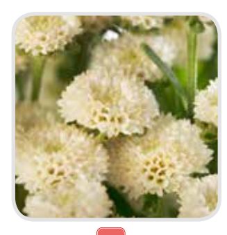
White Crown NEW White Crown is a double-flowered, scentless selection with sturdy stems and sprays of white flower buttons of 1,7 cm across. The upper leaves form a kind of crown around the starting ray florets.