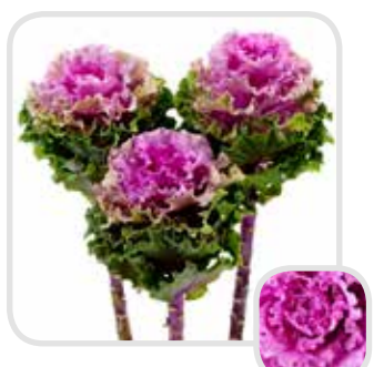
Empire Bogdana Rosy-red, wavy to fringed leaves, cropforming. For mid season harvest.