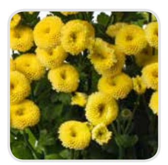
Amero Double-flowered type with fully double yellow flower buttons of approx. 2 cm across. Excellent plant habit, sufficient stem length and good foliage quality.

Years of breeding and long experience with Tanacetum cultivation have led to these successful cut flower selections which have proven themselves in the market. They are valued for their attractive flowers, and even more for their 'operational safety'. They produce a large number of first quality, uniform flower stems of 60 to 80 cm, have a good tolerance to disease and can thrive in less favourable climatic conditons. Our varieties can be grown year round, when light is available. The culture needs a minimum of 14 hours of light.