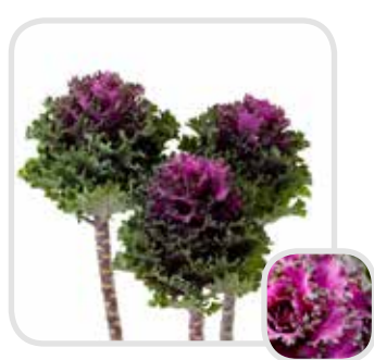
Empire Katya Deep pink with curled to crenulated leaves, bushy type. Late colouring, so best sown early for a trouble free late crop.