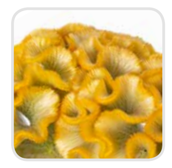
Act Inca Yellow