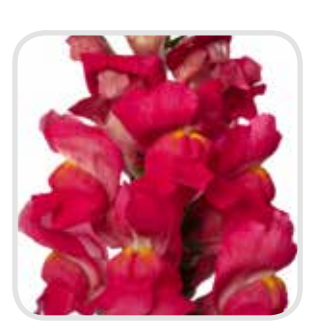
Costa Deep Rose