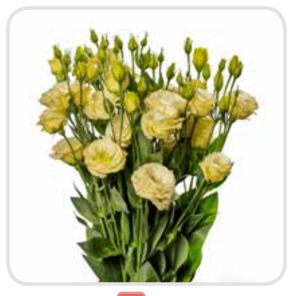
Evanthi Yellow II NEW