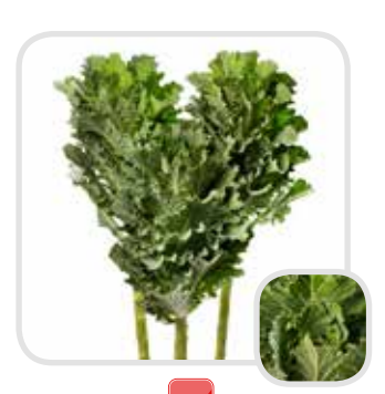
Empire Gruska Empire Gruska Creamy white heart and clear green, strongly crenulated and curled leaves. Very late colouring type for late harvest.