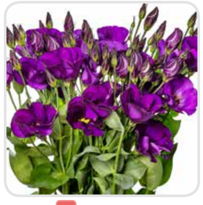
Owana III NEW large single flowers of a rich purple colour on a very sturdy stem.

Oletha II-III NEW very elegant type with soft pink single flowers with dark centre. Tough petals and sturdy stems ensure a trouble free culture.