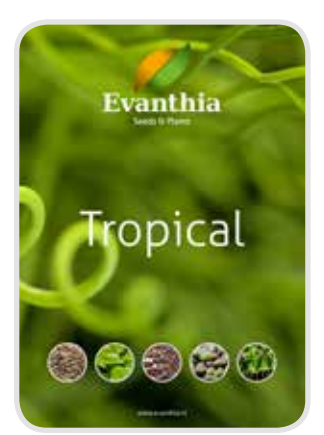
Evanthia Tropical www.evanthia.nl

Partners in various parts of the world supply us with a large assortment of tropical seeds of carefully selected plants, suitable for use as (mostly) indoor decoration. The range includes Asparagus, Coffea, Eucalyptus, Strelitzia types, just to name some, and also different species of cactus, palms and succulents. In addition to the supply of tropical seeds we have a wide assortment of tropical plants grown from seed that we supply in different trays sizes. New in our range are young plants from tissue culture. For the complete range, see our new brochure Evanthia Tropical!