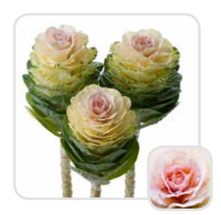
Empire Agathana White, flat, round leaves, compact, crop forming, no stretch. Excellent variety for late sowings and (very) late harvest.