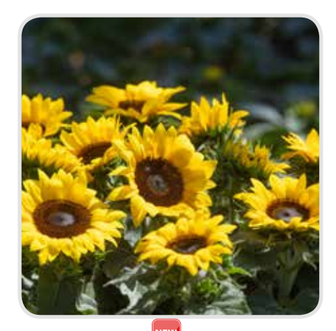
Sunsation® Yellow Spirit NEW Improved Yellow. Shorter harvest time and slightly more compact plant habit. Further characteristics as other Sunsation® colours.